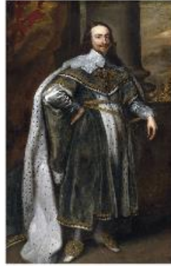
KING CHARLES I