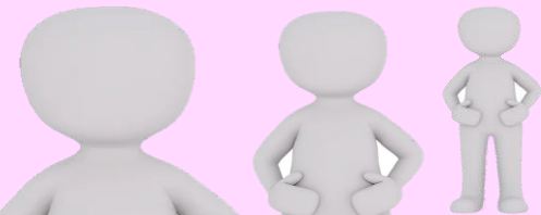
1. Close up 2. Mid range 3. Long shot